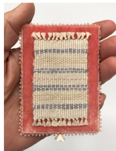
Robin's amulet, front and back