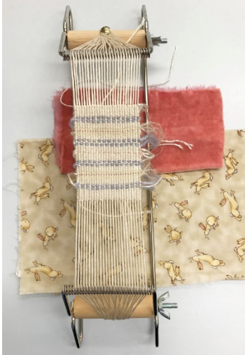
Amulet in process